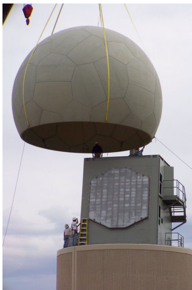
Installation of the SPY-1A antenna and radome on the NWRT

Phased array radar technology may help forecasters of the future provide earlier warnings for tornadoes and other types of severe and hazardous weather. Researchers are adapting the SPY-1 radar technology, developed by Lockheed Martin to support tactical operations aboard Navy ships, to weather detection. The phased array radar project has begun a new stage in NSSL's leadership in the research and development of future generations of weather radar.