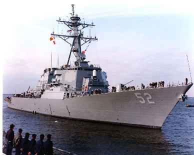
Phased array radar is currently used on Navy ships to support tactical operations.